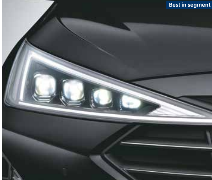
Dynamic LED quad projector headlamps with LED DRLs

Open your world to the sportier, grander and irresistible new Elantra. Retaining the classiness of the fluidic sculpture 2.0 design, it comes with premium additions that make it a stunner in every sense of the word. With dominant new front grille, dynamic headlamps and tail lamps, coupe-like roofline, the new Elantra is perfect for conquering the roads.