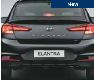
Sporty two tone rear bumper

Other features: Shark fin antenna | New front bumper design