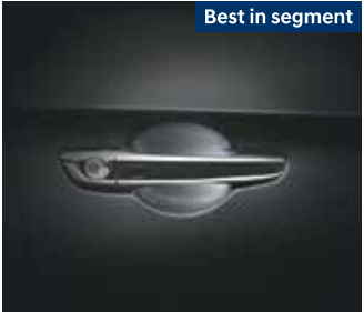
Chrome door handles with pocket light