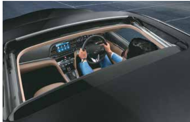
Smart electric sunroof

The new Elantra has everything it takes to delight you. It hosts a world of innovative features that have been designed keeping your convenience and comfort in mind. The result is an unforgettable driving experience that only a few deserve.