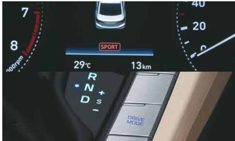
Drive mode select: normal, eco, sport & smart