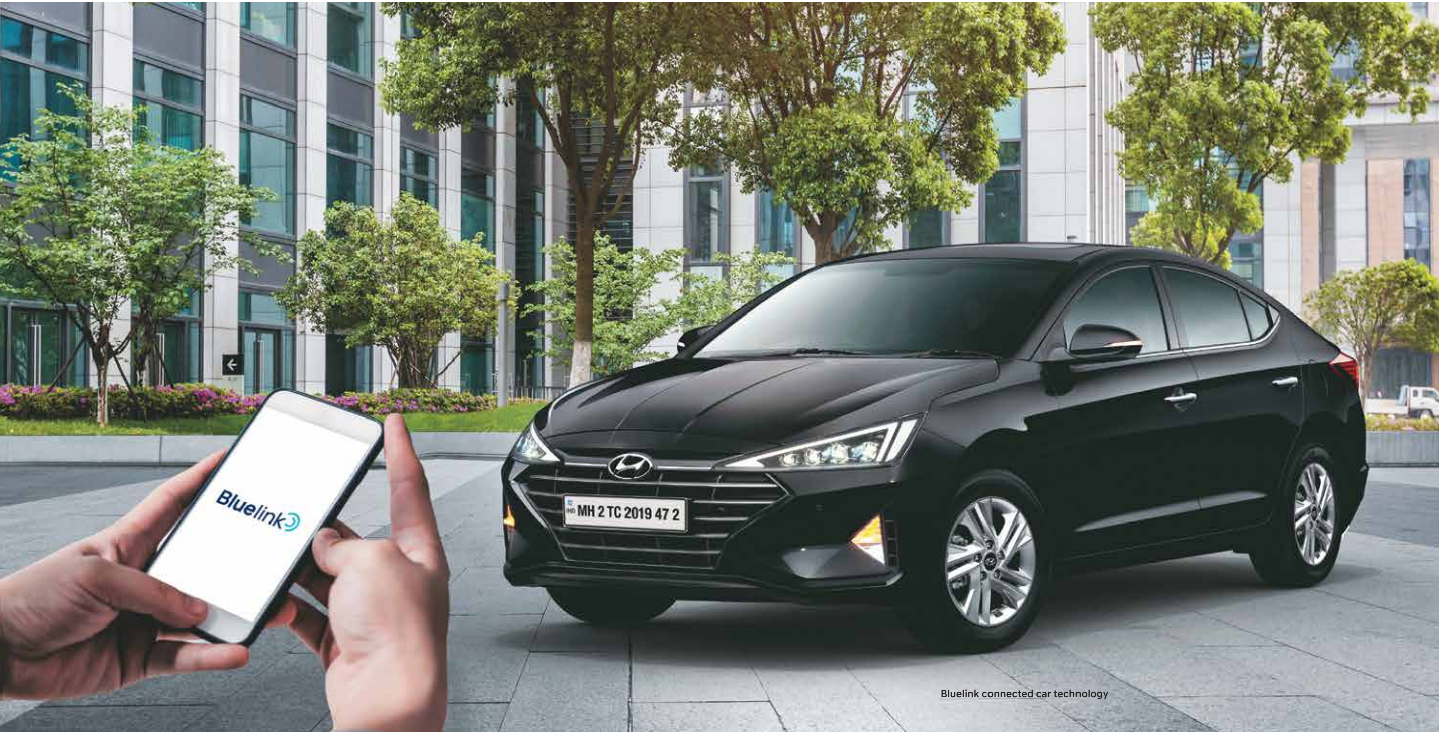
BlueLink connected car technology