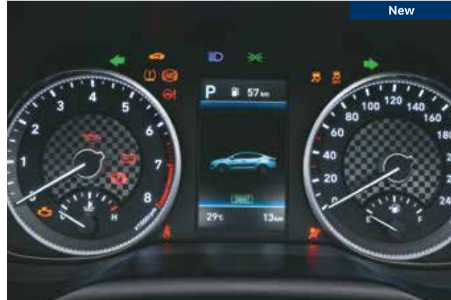
Instrument cluster with coloured multi information display

Taking a seat in the new ELANTRA is like entering a world of opulence that has been created exclusively for you. It boasts of a driver-centric ergonomic design and many new additions, the centre fascia being one of them. Simply put, it is a treat to watch, to own and to drive.