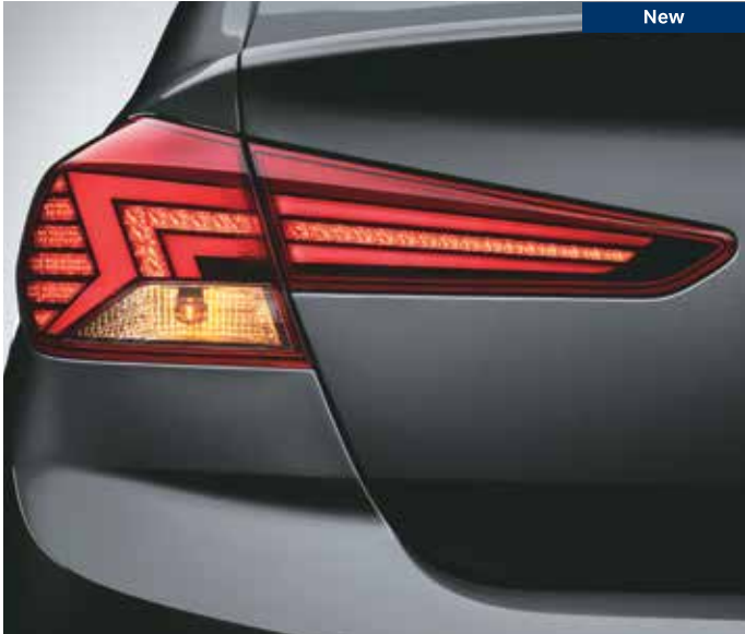
Sporty rear combination LED tail lamps