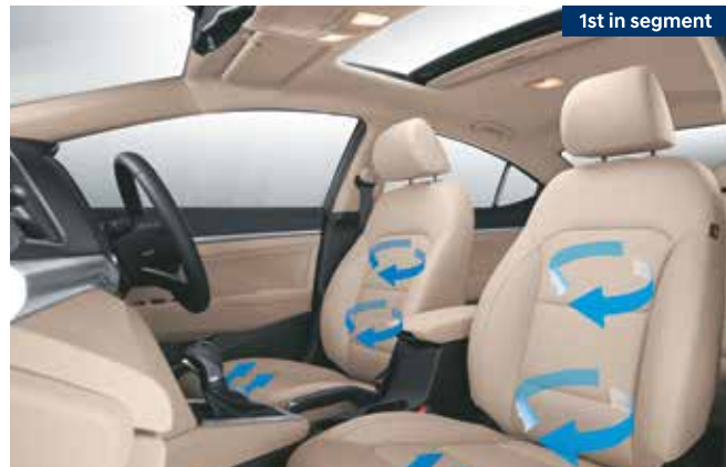
Front ventilated seats