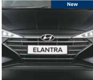
Dominant front grille design