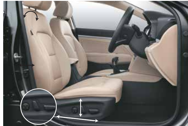
10 way adjustable power driver seat with electric lumbar support

Other features: Sporty aluminium pedals | Driver-centric ergonomic design Rear centre armrest with cup holder | Rear defogger | Premium aluminium scuff plates Sliding front centre armrest with storage