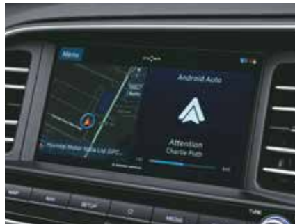
20.32cm (8") HD smart touchscreen infotainment with navigation & BlueLink