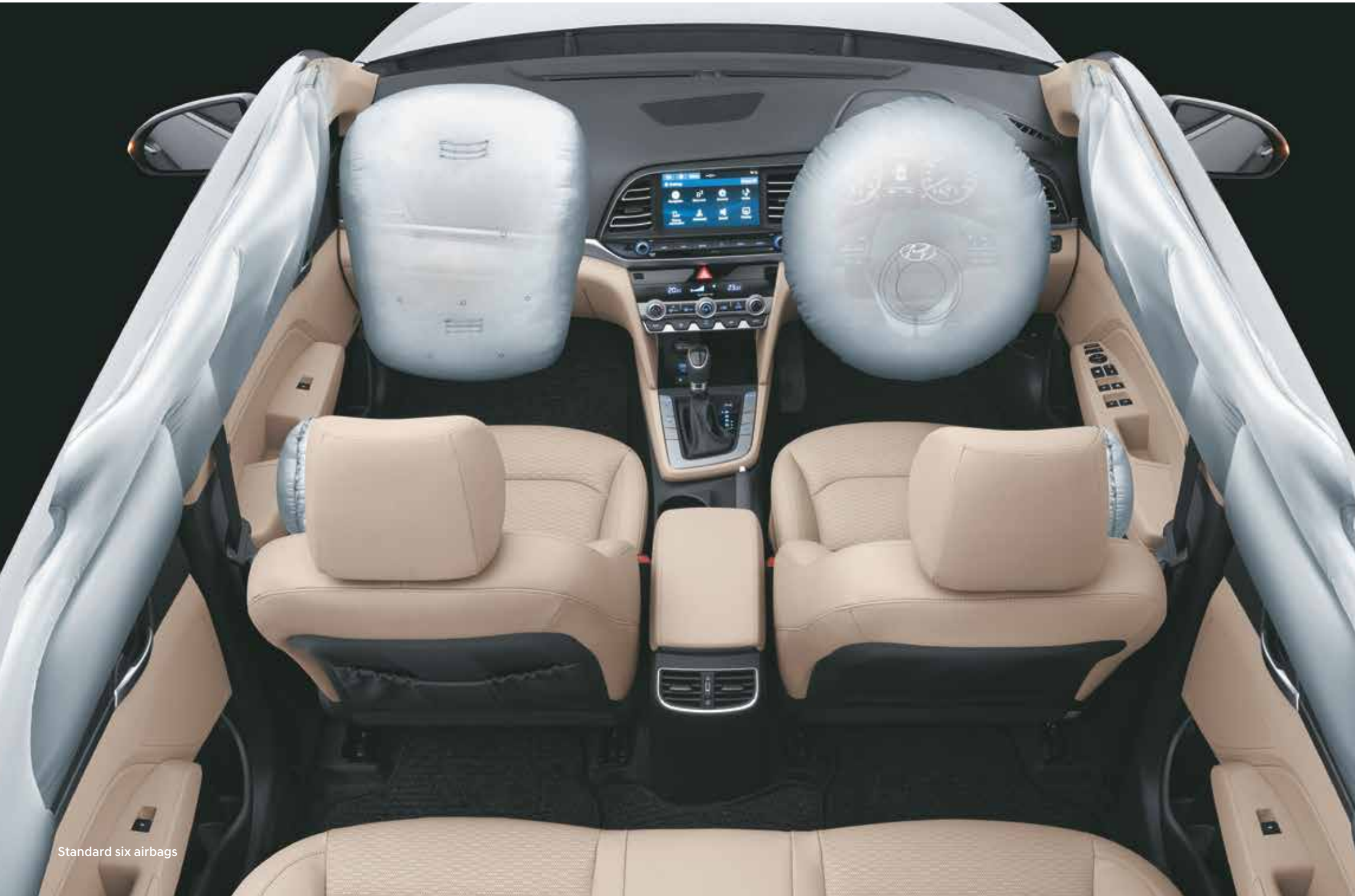
Standard six airbags