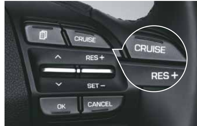
Auto cruise control