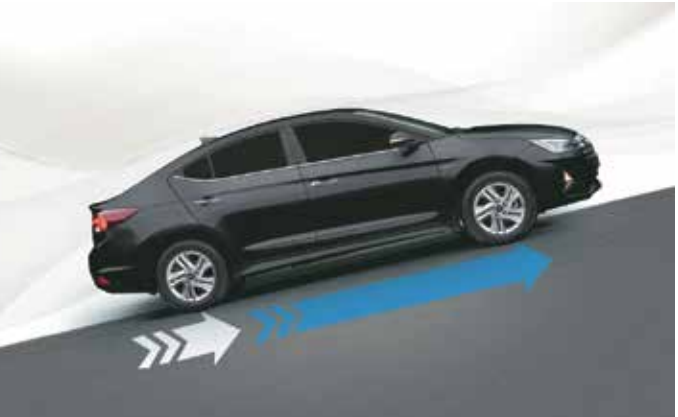
Hill assist control

Other features: Burglar alarm | Speed sensing auto door lock | Strong body structure with AHSS | Electronic stability control (ESC)