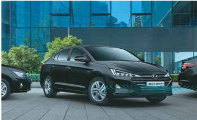
Front & rear parking sensors with rear camera