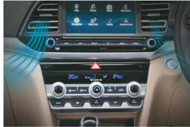
Dual zone FATC with cluster ionizer