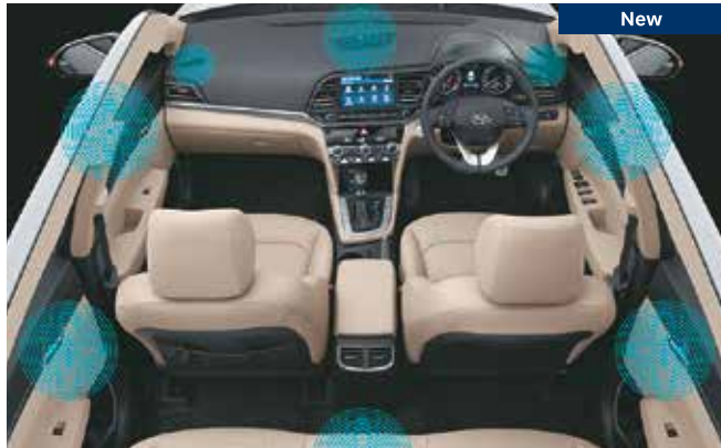
Premium Infinity sound system with door speakers, centre speaker, tweeters, amplifier, sub-woofer