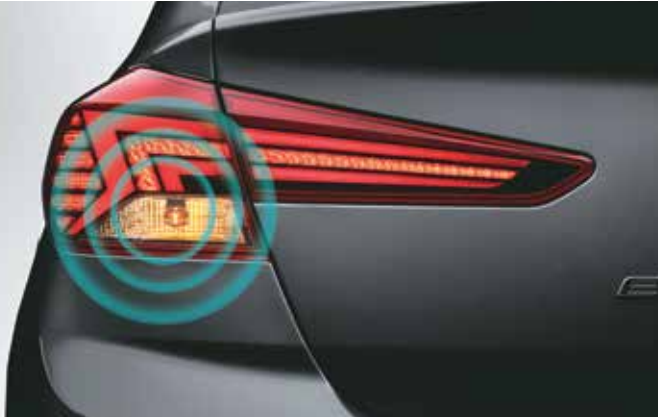
Emergency stop signal