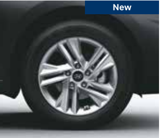
Stylish R16 (D= 405.6mm) alloy wheels