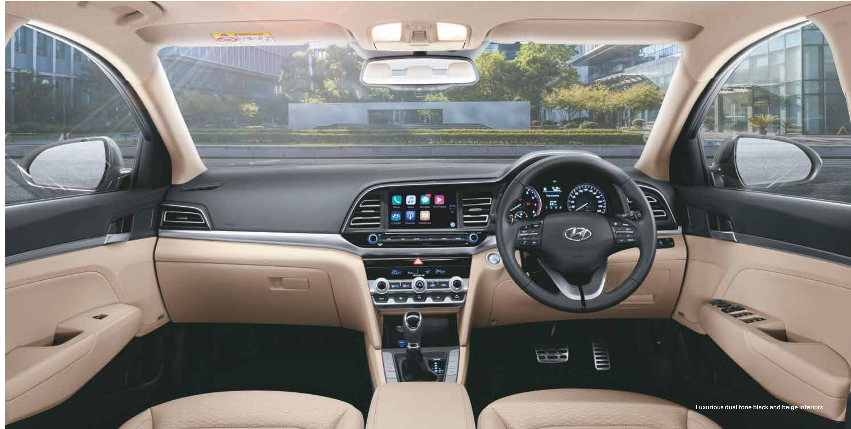
Luxurious dual tone black and beige interiors