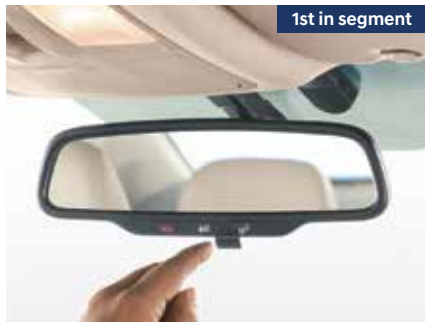
IRVM with BlueLink