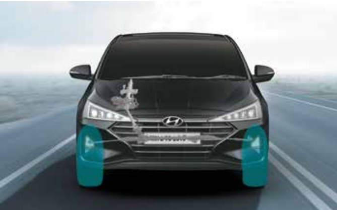
Vehicle stability management