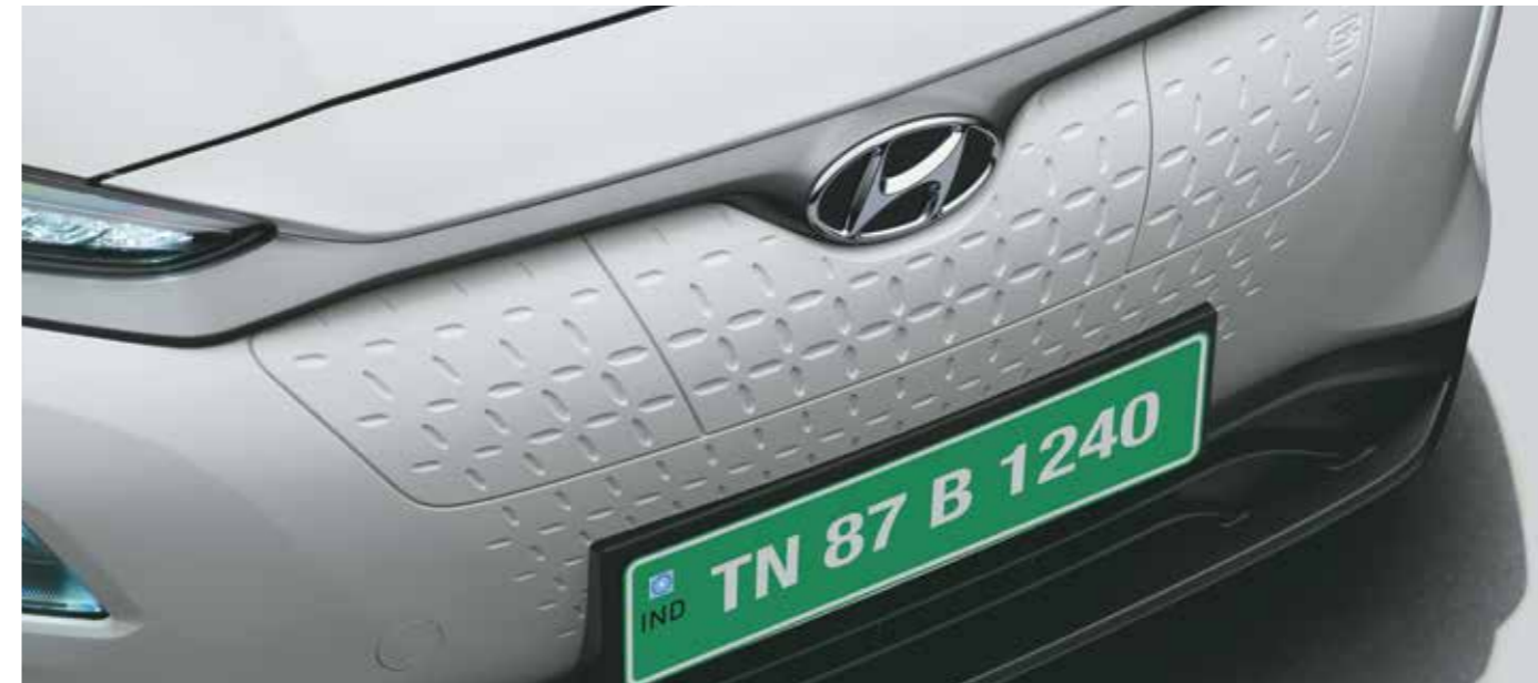
Modern, clean & integrated front grille design optimized for superior aerodynamics