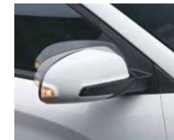
ORVM (heated) with electric adjust and folding