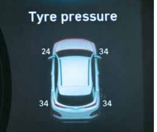
Tyre pressure monitoring system (high line)