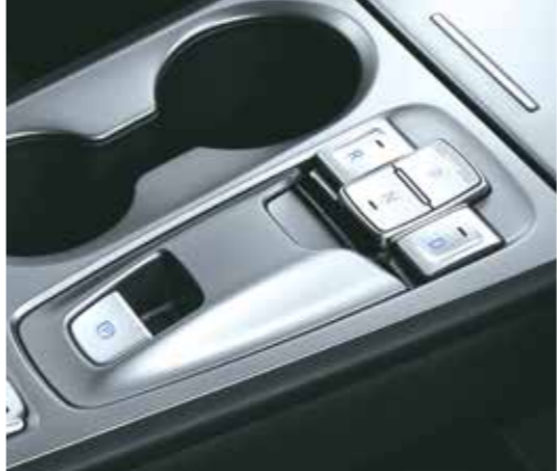
Shift-by-wire automatic transmission and electric parking brake

The second you get into KONA Electric, you enter the heart of unmatched comfort. Intelligently placed button type shift-by-wire system, impeccably designed bridge-type centre console; everything has been designed and positioned to make your driving experience as smooth as possible.