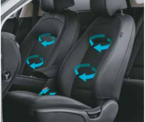
Front ventilated and heated seats