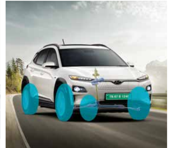
Vehicle stability management (VSM)