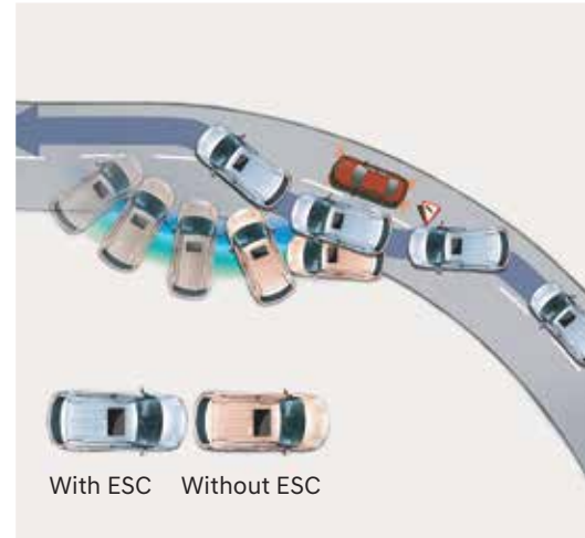
Electronic stability control (ESC)