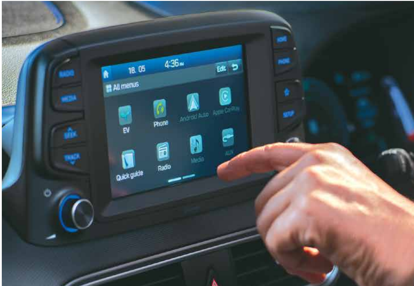
17.7cm (7") Touchscreen Display Audio with Android Auto and Apple CarPlay screen

Get ready for a hassle-free life with KONA Electric that has been created to fit in your world seamlessly. Now you can access your phone, your favourite music and maps, using the multimedia touchscreen display that comes with Apple CarPlay and Android Auto compatibility. To ensure your phone never runs out of battery, there is a wireless charging pad.