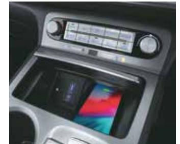
Wireless phone charger