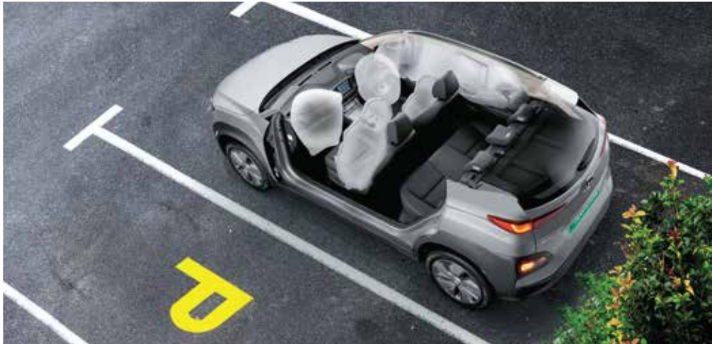
6 Airbags (driver, passenger, front side & curtain)

KONA Electric comes with superior safety features to keep you out of harm's way. Made of ultra-high tensile strength steel, KONA Electric offers high impact energy absorption that keeps the passengers safe in the unfortunate event of a collision. The cabin has been especially designed to disperse energy to reduce impact on the occupants.