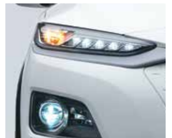
Distinctive split type LED headlamps with LED DRLs

Other features: Roof rails | Body color ORVM with turn indicators | Body colour door handles | Dual tone roof (option) | Smart electric sunroof with safety | Side sill molding – black