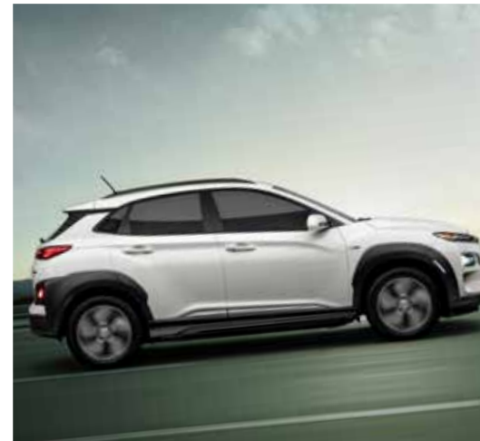
Hill-start assist control (HAC)