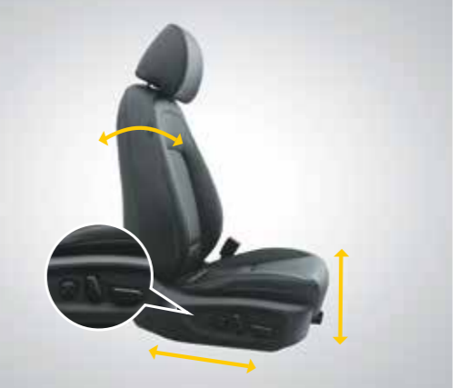
10-way power driver seat with lumbar support