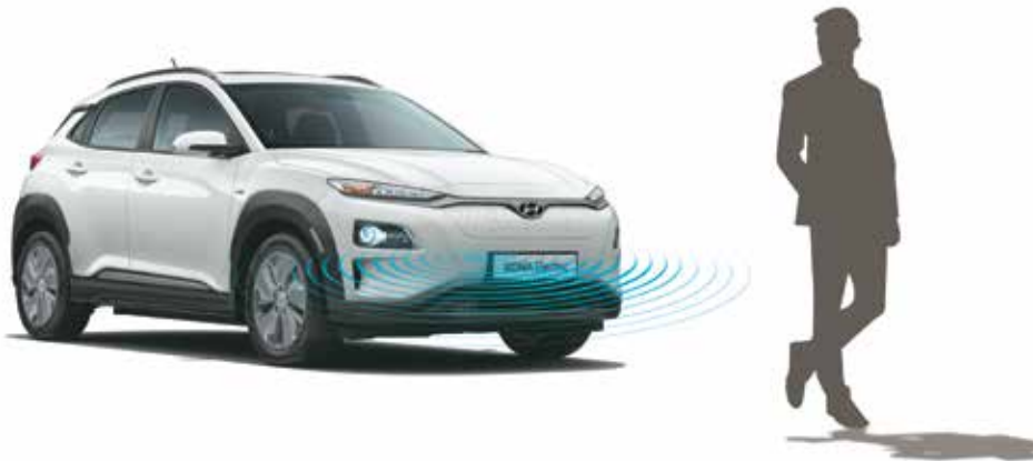
Virtual engine sound system When the vehicle is in motion, VESS generates an engine sound to ensure pedestrian safety