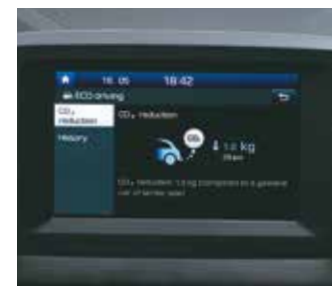
ECO driving information