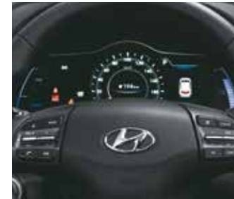
Digital instrument cluster with supervision