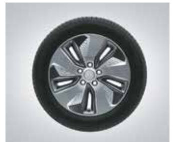
R17 (D=436.6 mm) EV exclusive alloy wheels