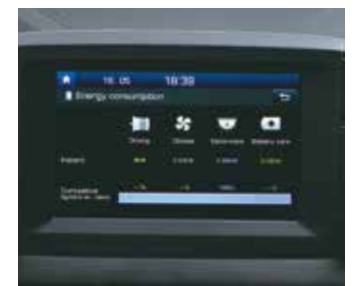
Power consumption information