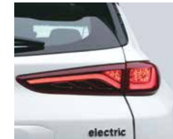
LED tail lamps