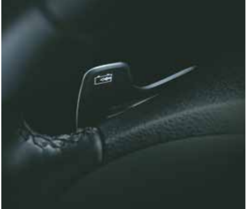
One pedal driving