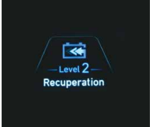
Paddle shifters (for regenerative braking)