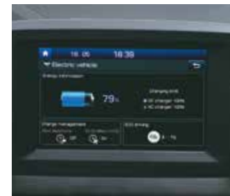
EV menu screens