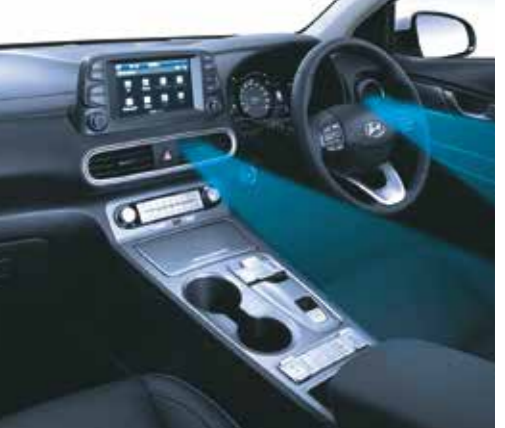
Option of driver only air conditioning

Other features: Bridge-type centre console | Leather wrapped steering wheel | LED luggage lamp Leather seats | Rear adjustable headrests | Rear split seats 60:40 | Soft touch dashboard