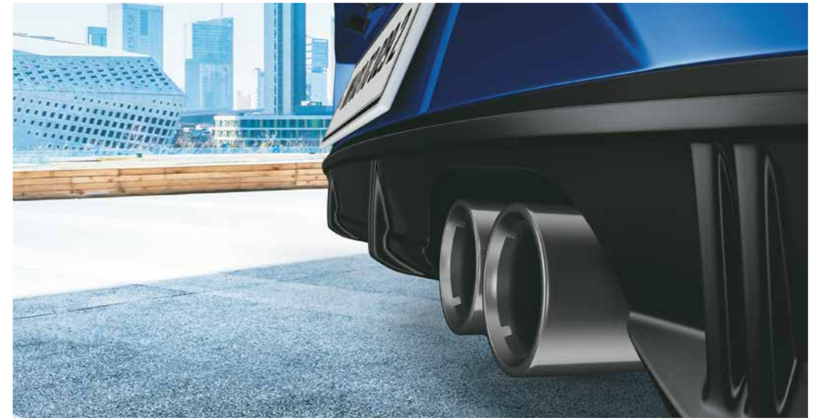
Twin tip muffler