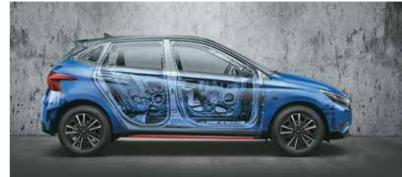
Strong body structure with AHSS & HSS