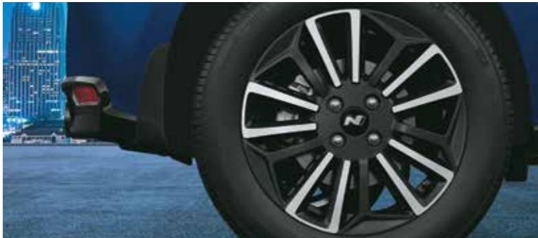
Rear disc brakes