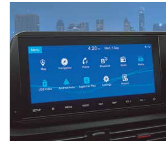
26.03 cm (10.25") HD touchscreen infotainment & navigation system