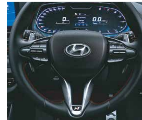
3-spoke steering wheel with N logo

With Over-the-Air (OTA) map updates* 3 years free Bluelink subscription