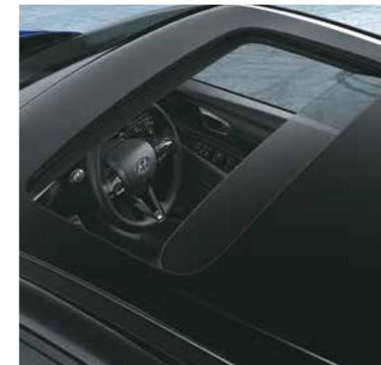
Voice enabled smart electric sunroof