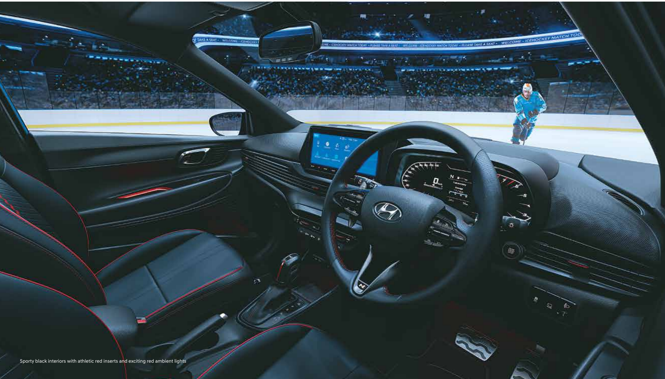
Sporty black interiors with athletic red inserts and exciting red ambient lights