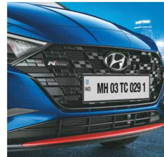
Chequered flag inspired front grille

Images are for creative purposes only. Please do not imitate. Hyundai encourages safe driving practices.