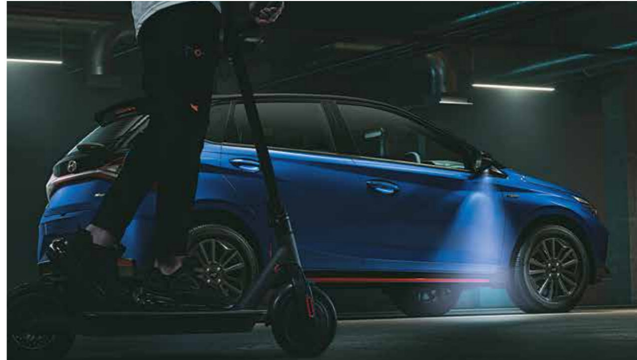
Puddle lamps with welcome function