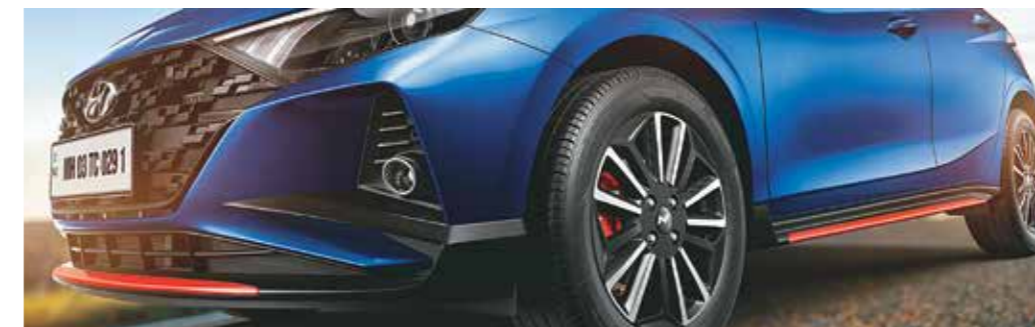
Athletic red highlights* (front skid plate & side sill garnish)

Sporty and breathtakingly stunning, the Hyundai i20 N Line commands attention everywhere it goes with its WRC inspired sporty new design. Its exciting new athletic design and playful details set you apart from the crowd in a field of lookalikes.