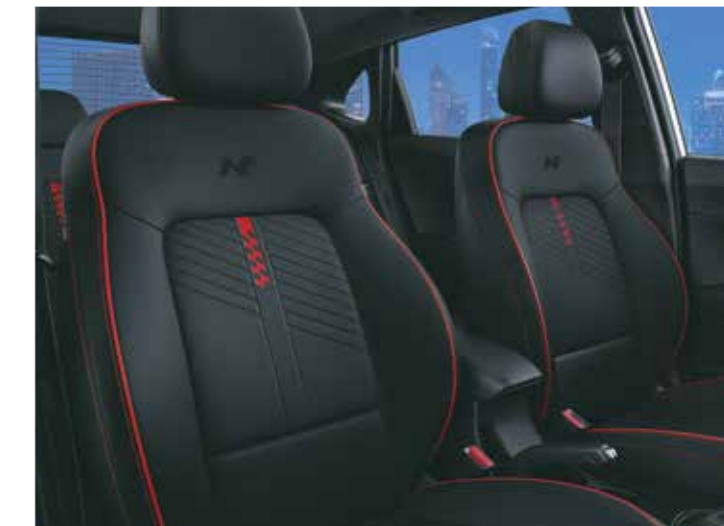
Chequered flag design leather* seats with N logo