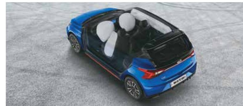
Driver, passenger, side & curtain airbags