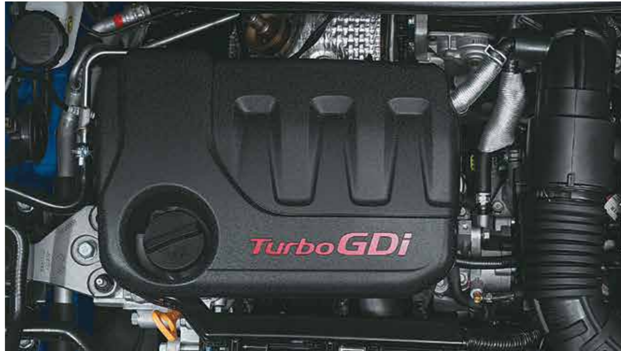
1.0 l Turbo GDi petrol engine with max. power of 88.3 kW (120 PS) / 6 000 r/min