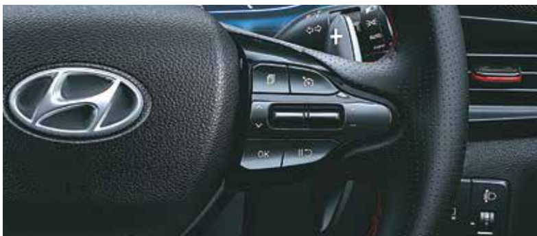
Paddle shifters (DCT only)