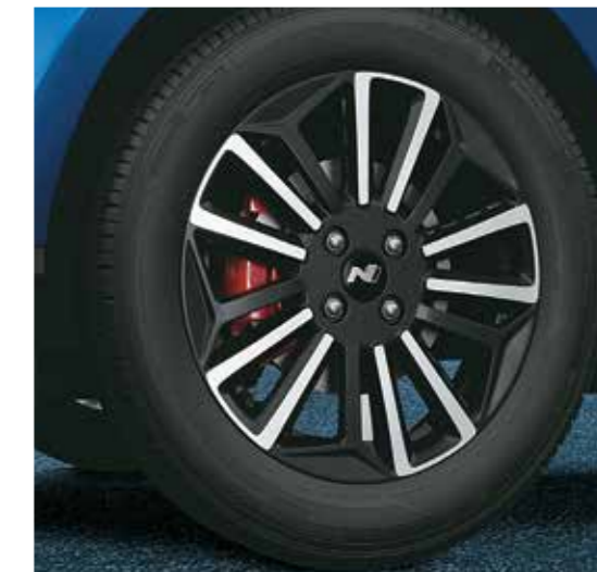
R16 (D=405.6mm) diamond cut alloy wheels with N logo and front disc brakes with red caliper