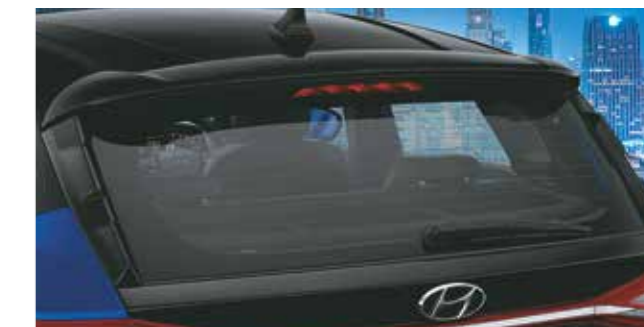
Sporty tailgate spoiler with side wings

Other features – LED projector headlamps with LED day time running lamps (DRL) | Dark chrome connecting tail lamp garnish Front fog lamp chrome garnish