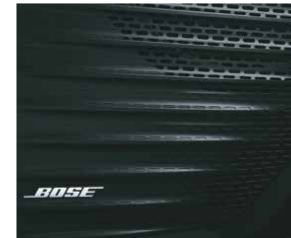
Bose premium 7 speaker system

Other features – Wireless charger with cooling pad | Digital cluster with TFT multi information display (MID) | Rear seat armrest