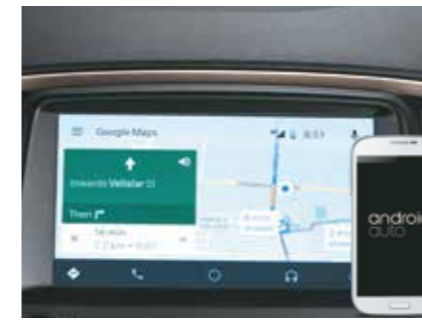
Android Auto connectivity