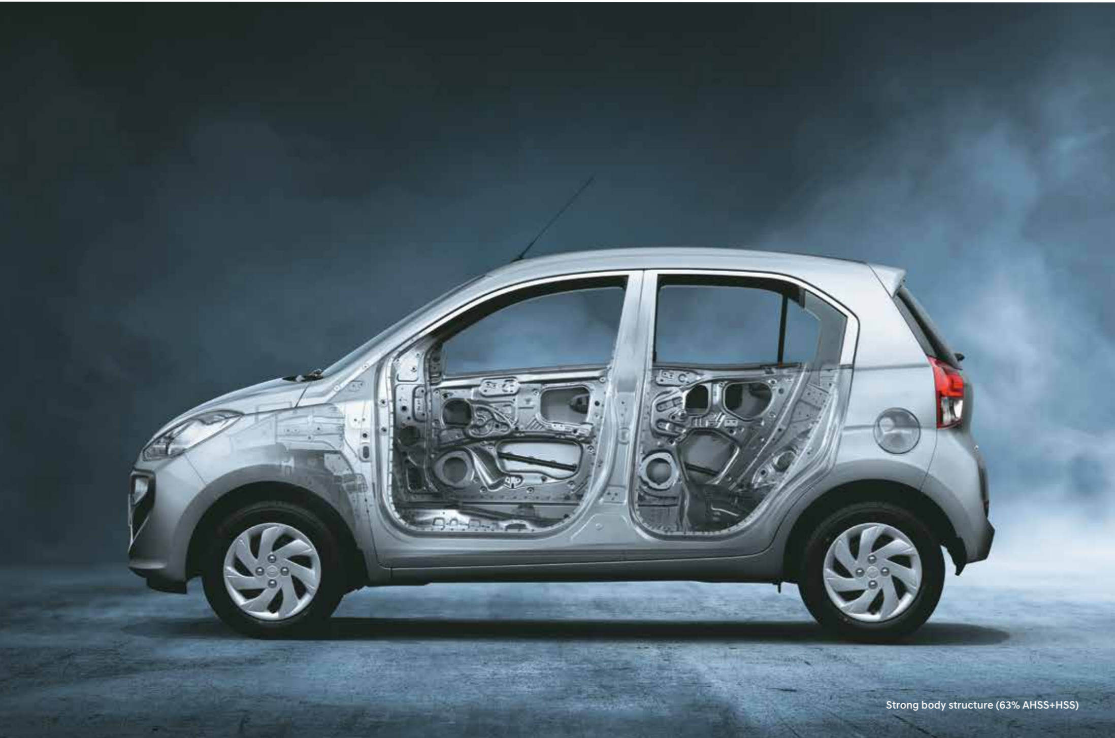
Strong body structure (63% AHSS+HSS)