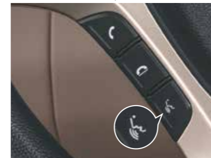
Voice recognition button on steering