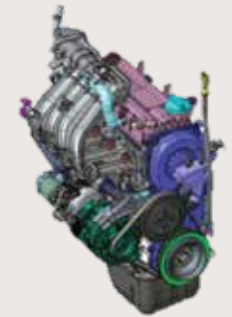
4 Cylinder petrol engine

50.7 Maximum power kW (69 PS) / 5 500 r/min