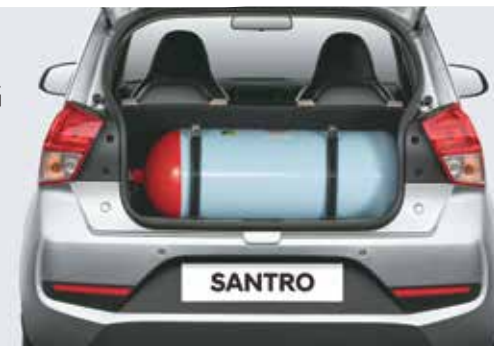
Convenient CNG filling (near petrol fill area)