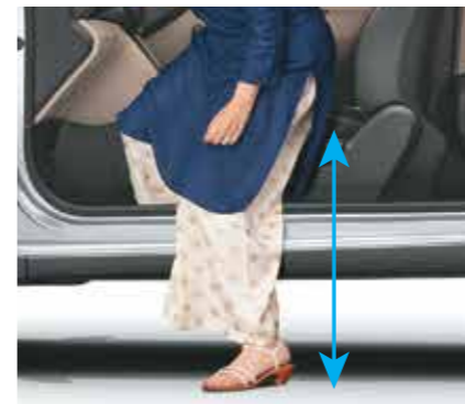
Spacious cabin with easy ingress/egress