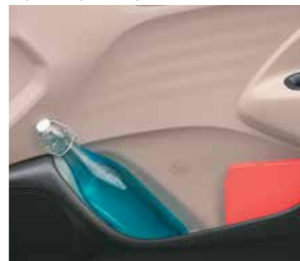
Map pocket with 1l bottle holder