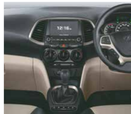
Elephant inspired unique centre fascia

The Santro offers more room for the entire family and their growing needs. Now you will find long drives more enjoyable and less tiring.