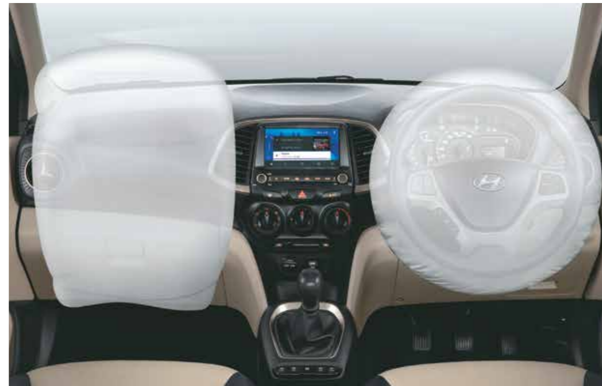
Dual front airbags