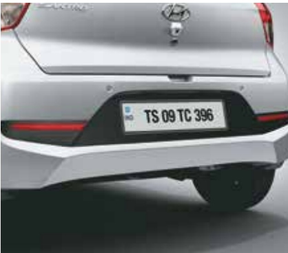
Dual tone body color bumpers with reflectors

Other features: Body colour door handles | R14 (D=354.8 mm) steel wheel with cover | Z-Shaped character lines