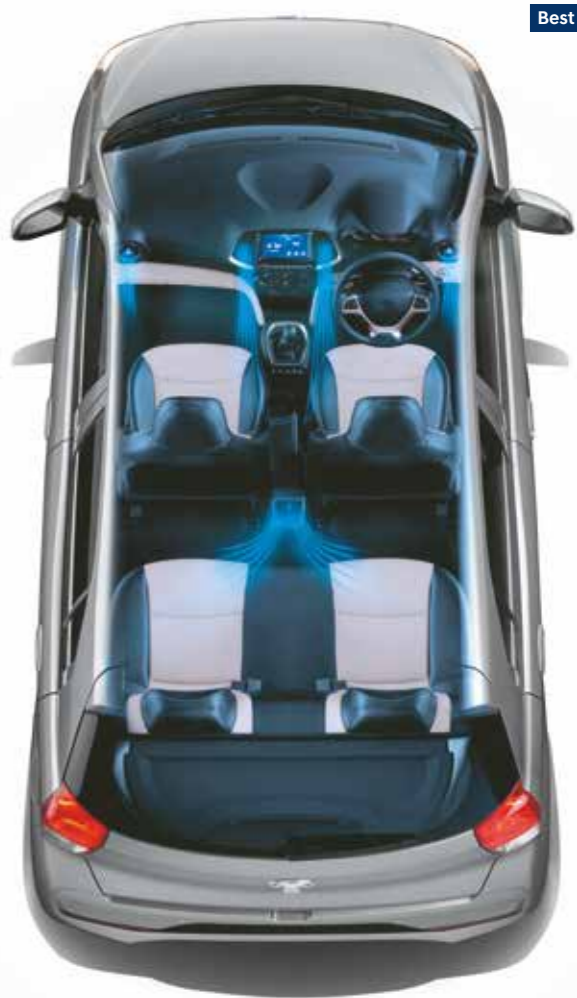
Superior AC performance

Other features: Floor mat hook | Passenger vanity mirror