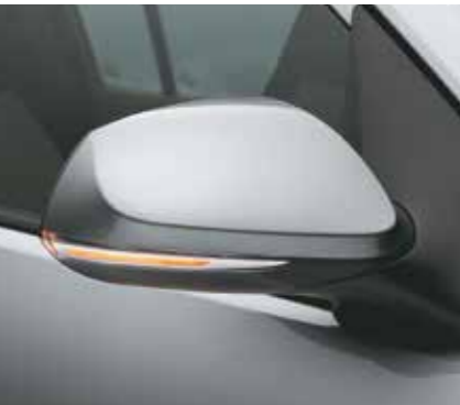
ORVM with electric adjustment & turn indicators