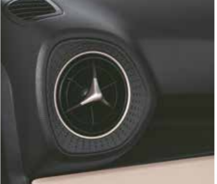
Unique propeller design air con vents