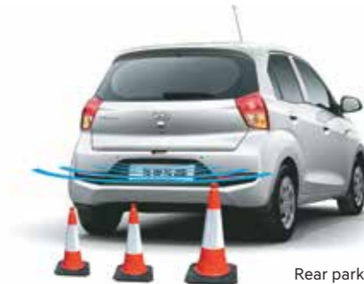
Rear parking sensors

Other features: Driver seat belt reminder