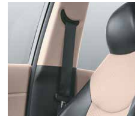
Front seatbelt pretensioners with load limiters