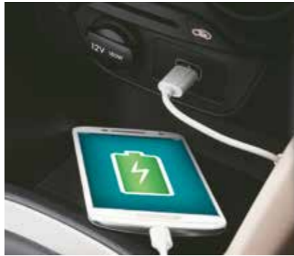
Power outlet & USB port

The Santro is thoughtfully designed for the comfort and convenience of your loved ones. Its ergonomically crafted interiors with champagne gold inserts and a host of features enhance the overall driving experience.