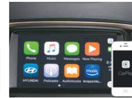
Apple CarPlay connectivity