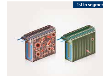
Eco coating technology