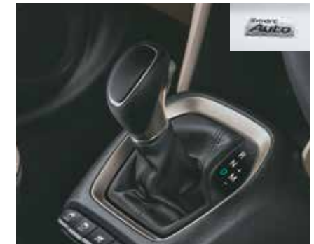
Smart auto AMT