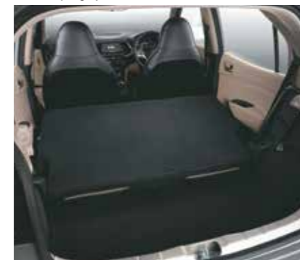
Rear seat bench folding