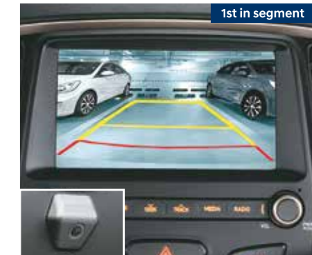
Rear parking camera with display on 17.64 cm (7") audio video screen