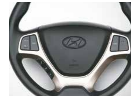
Steering mounted audio & Bluetooth controls