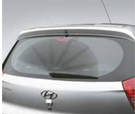
Rear washer & wiper