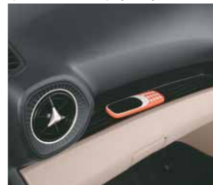
Practical storage area