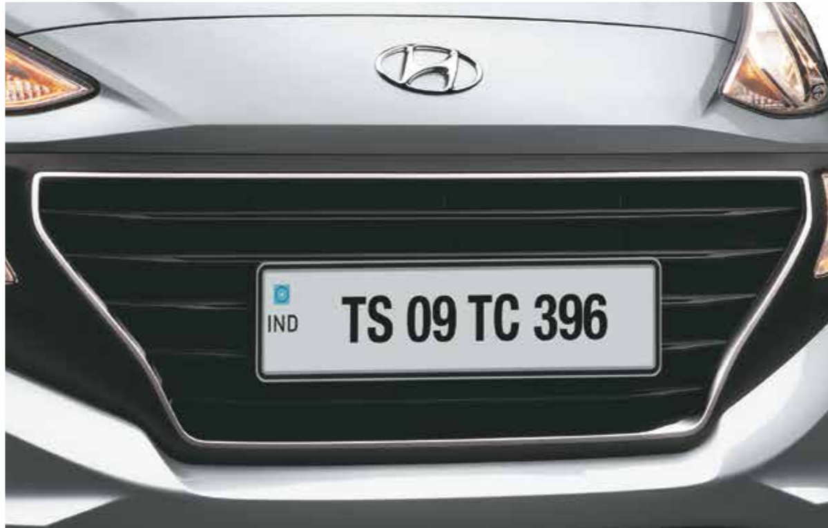
"Cascade design" chrome front grille

Designed for the entire family's pleasure, Santro comes with a modern design and a confident stance. While you relish its unmistakable cascade grille, high perched fog lamps, stylish headlamps and tail lamps, let others admire the modern and unique Z-shaped character lines.