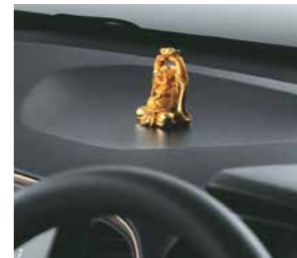
Idol keeping space