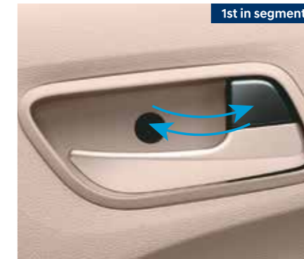
Speed sensing auto door lock & Impact sensing auto door unlock