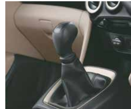
5-speed manual transmission