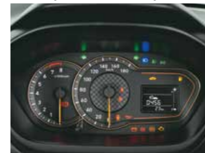
6.35 cm (2.6") Advanced cluster with multi Information display (MID)