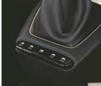
Ergonomically positioned power window switches