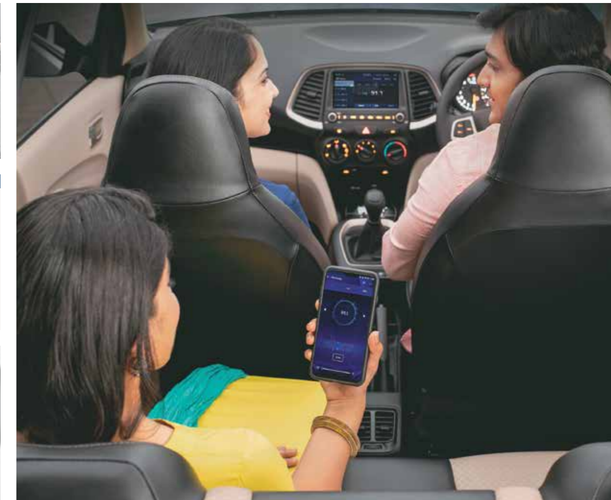
Hyundai iBlue smart phone app for audio remote control*

Other features: 17.64 cm (7") Touchscreen audio video system with smart phone connectivity | Mirror link