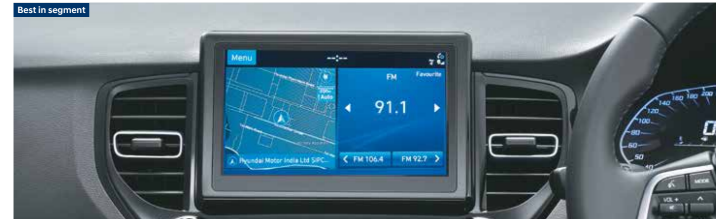
20.32 cm (8") touchscreen AVNT with HD display