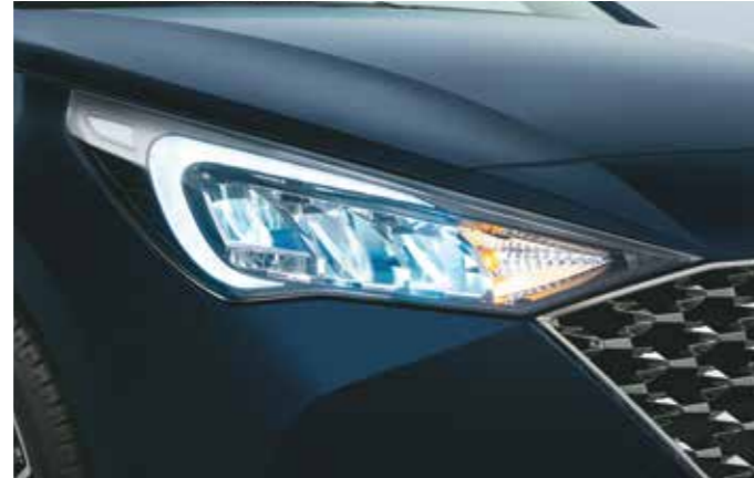
Full LED headlamps