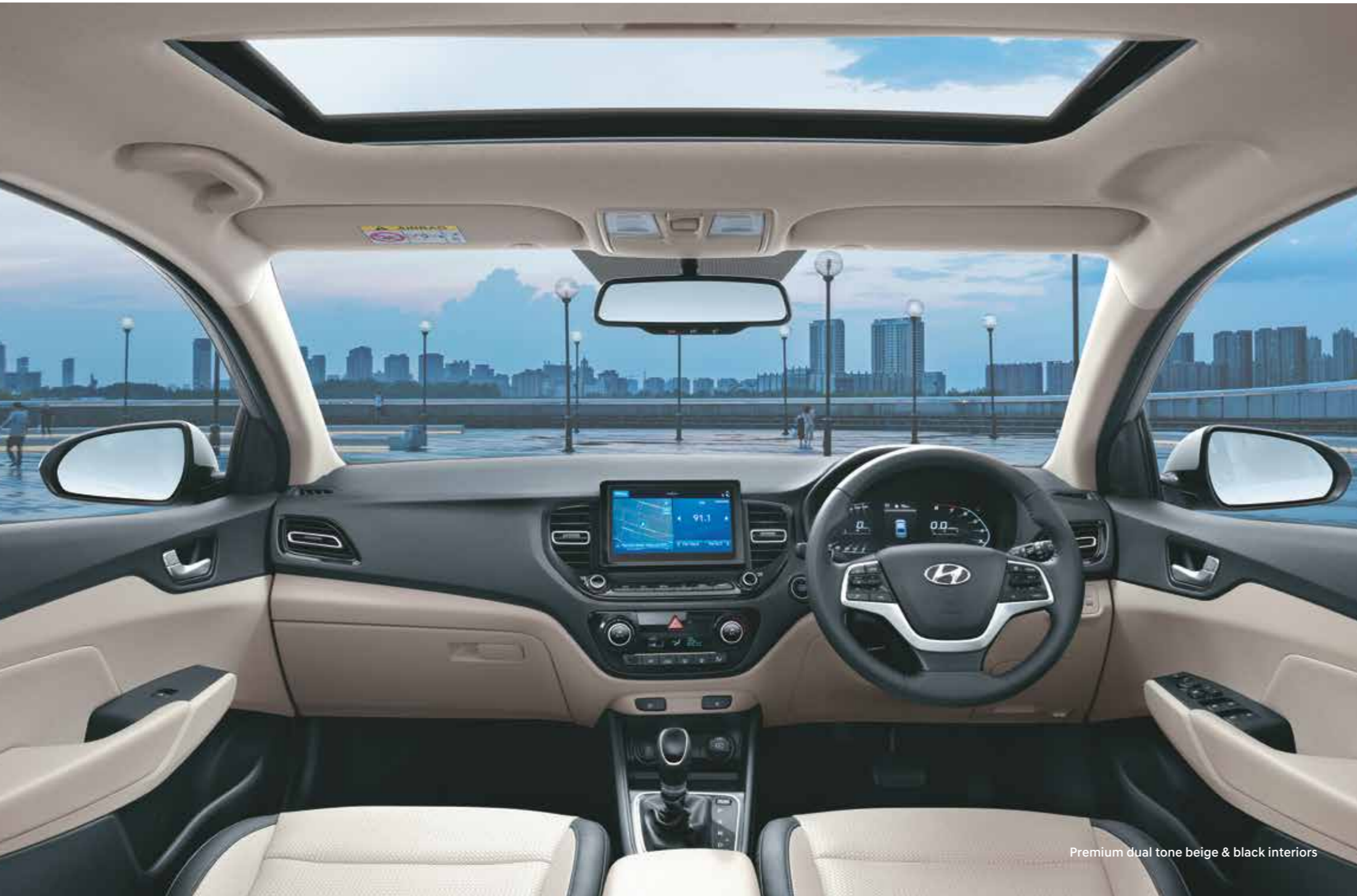
Premium dual tone beige & black interiors