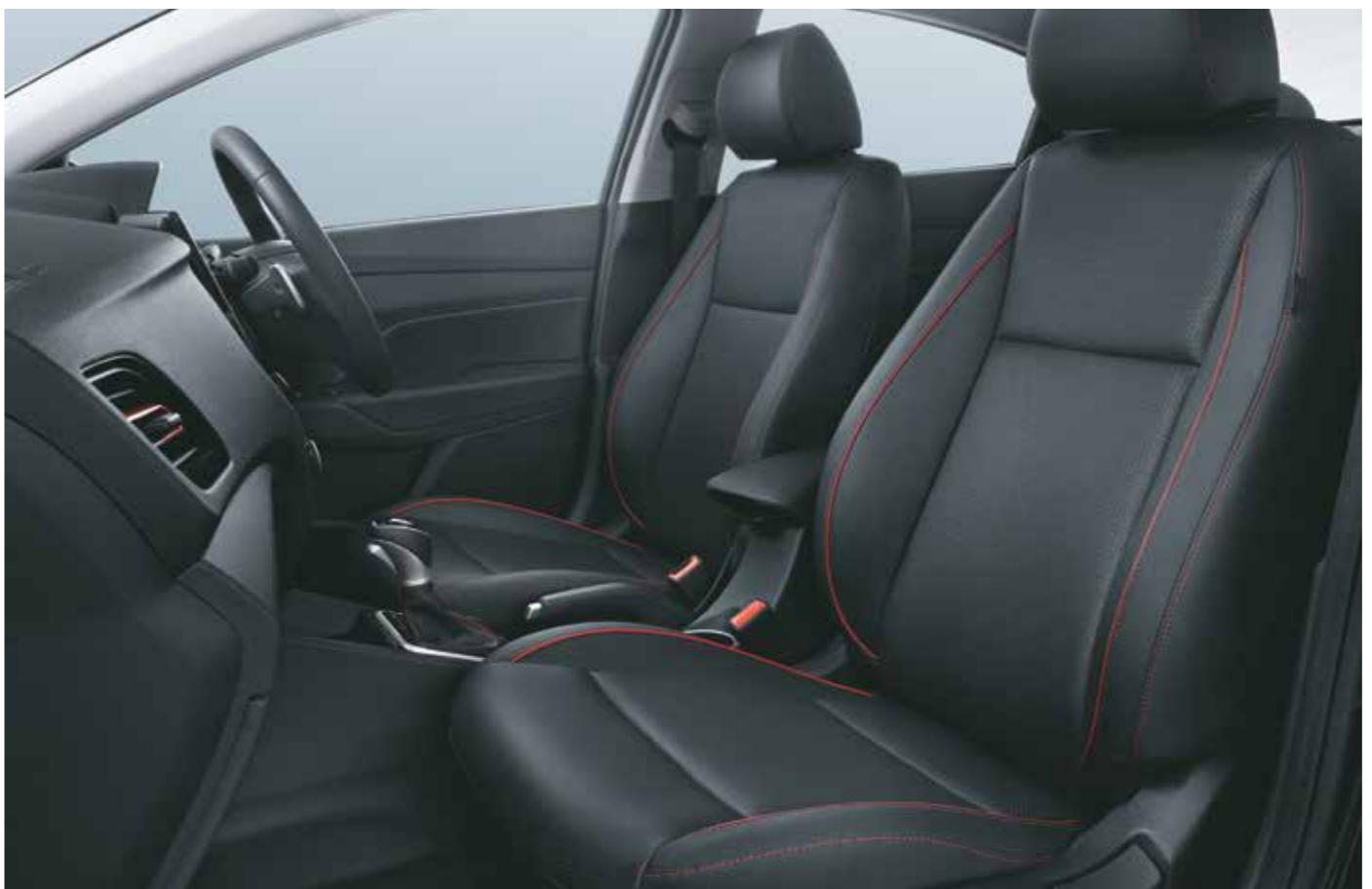
All black interiors with red accents (turbo)

Experience the touch of finesse every time you take a seat in the spirited new VERNA. The new premium dual tone beige & black interiors and all black interiors with red accents (turbo) lend a classy vibe to the cabin, designed to match your killer instinct.