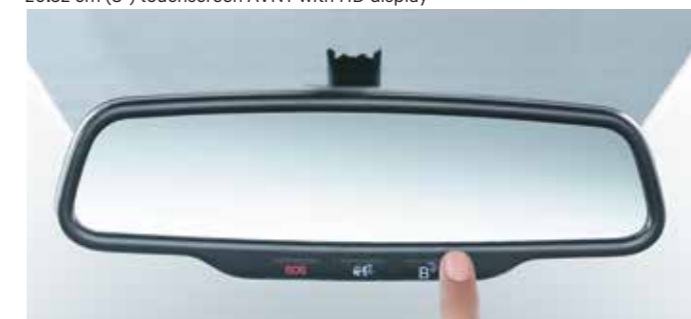
Electro chromic mirror - IRVM with BlueLink switches