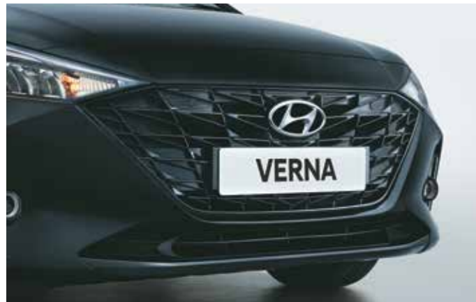
Glossy black front radiator grille (turbo)