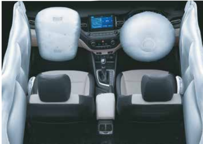
6 airbags (driver, passenger, front side & curtain)