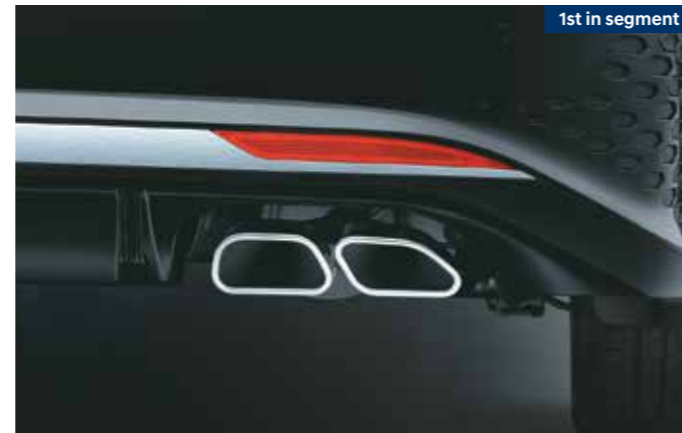
Twin tip muffler (turbo)