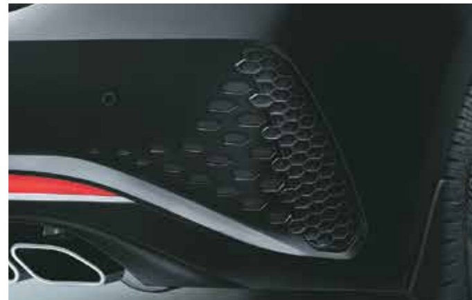
Sporty bumper design (turbo)