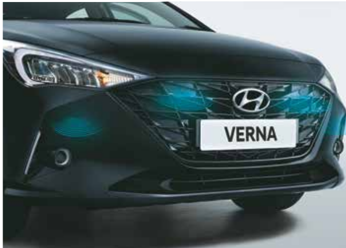
Front parking sensors (turbo)