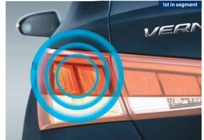
Emergency stop signal (ESS)

Other features: Speed sensing auto door lock | Impact sensing auto door unlock | Strong body structure 73% (AHSS + HSS) | Rear parking camera with dynamic guidelines | Headlamp escort function | Automatic headlamps | Vehicle stability management (VSM) | Electronic stability control (ESC) | Hill start assist control (HAC)