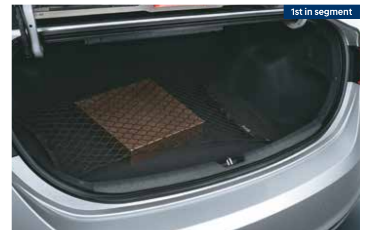
1st in segment