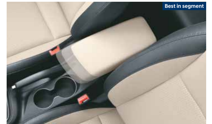
Best in segment