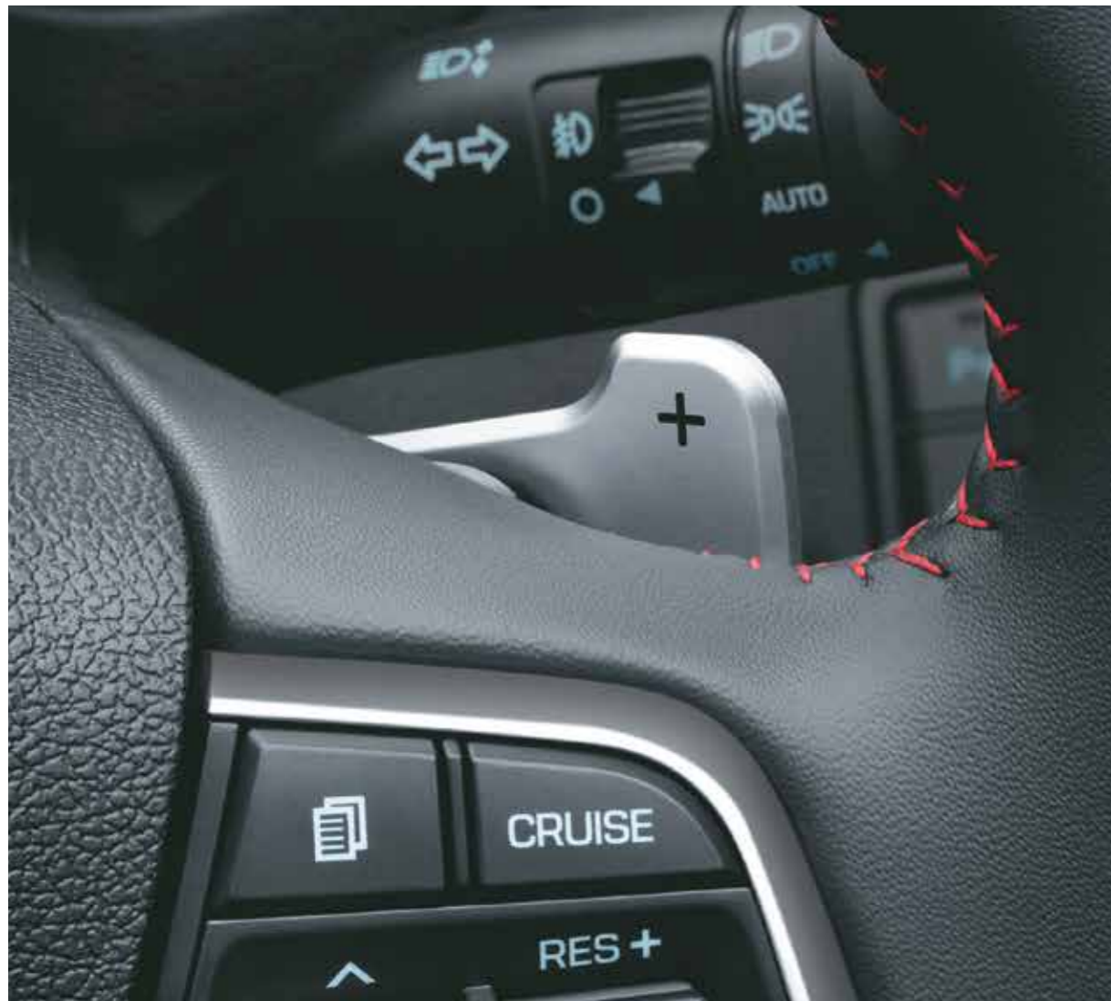
Paddle shifters (turbo)

The spirited new VERNA is not just all looks. Pop open the hood and you'll know what it's all about. With exciting new engine variants, transmission options and brand new paddle shifters (turbo), experience the power of the spirited new VERNA as you charge ahead and take control of the city roads.