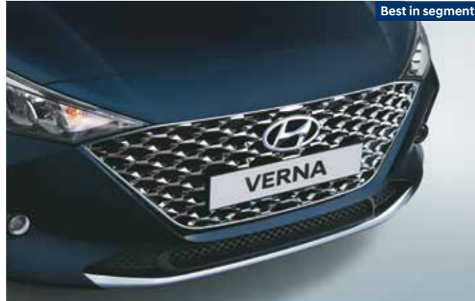
Dark chrome front radiator grille

Take a walk around the spirited new VERNA and be charmed by its exquisitely crafted sensuous sporty design and mesmerising front grille. Observe its new full LED headlamps, LED tail lamps and the twin tip muffler (turbo). Let its sporty R16 diamond cut alloy wheels sweep you off your feet.