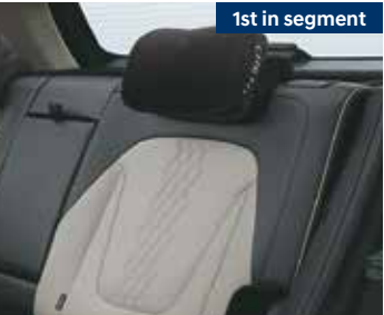
Rear seat headrest cushion