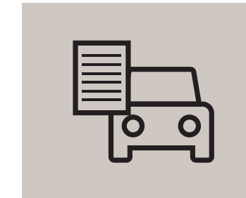
Monthly health report