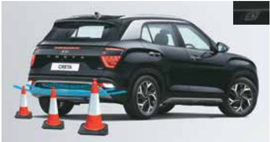
Rear parking sensors with camera