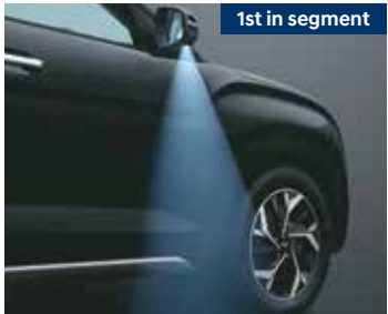
Welcome function with auto unfold ORVMs & puddle lamps