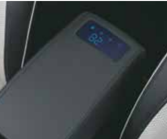
Auto healthy air purifier

Other features: Leather wrapped D-cut steering wheel | Leather TGS knob | Automatic headlamps | Smartphone wireless charger | Electro chromic mirror (ECM) | Door scuff plates – metallic | Rear window sunshade | Power driver seat - 8 way | 17.78 cm (7.0") Supervision cluster with digital display | Cruise control | 60:40 split rear seat 2-step reclining rear seat