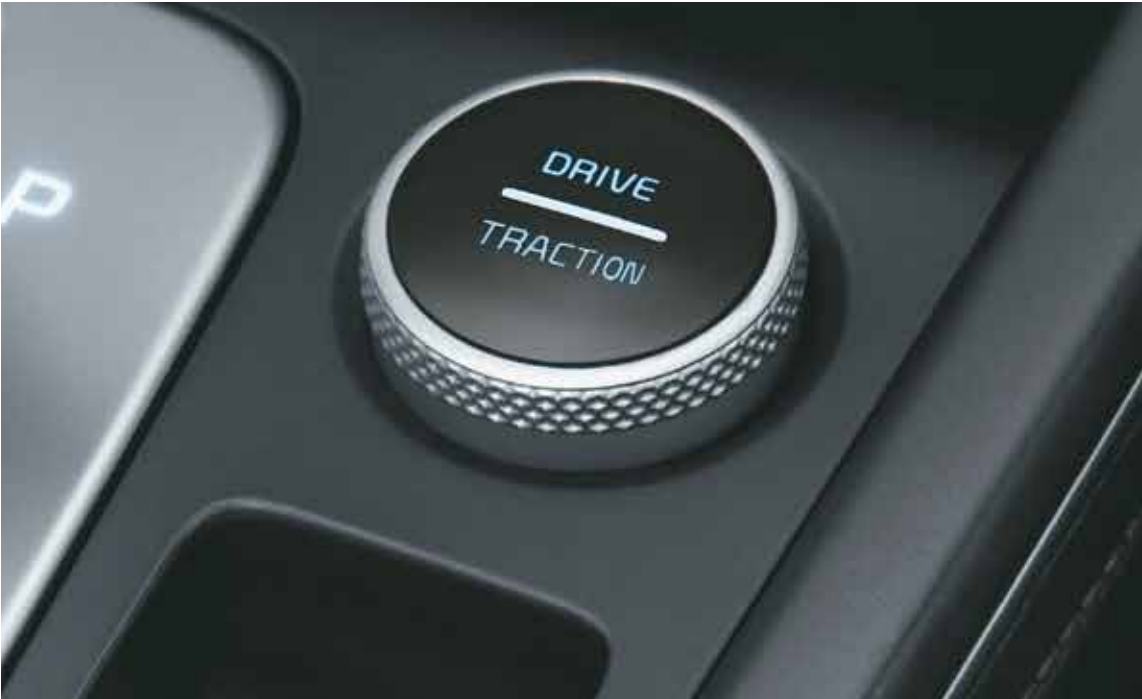
Traction control mode (snow, sand, mud)

With the new 1.4l petrol, 1.5l petrol and 1.5l diesel BS6 engines under the hood, the all-new Creta delivers a power packed performance on every terrain. Be it on the road or off it, the all-new Creta has the dynamism to go the distance.