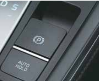
Electric parking brake with auto hold