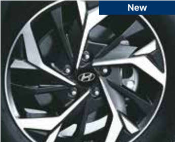
Rear disc brakes