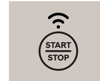
Remote engine start/stop (AT/DCT & MT)