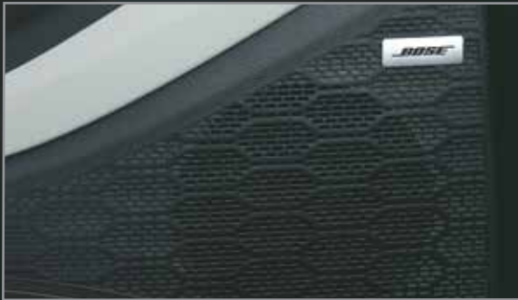
Bose premium sound system (8 speakers)