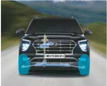
Vehicle stability management (VSM)