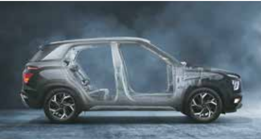
Strong body structure with AHSS