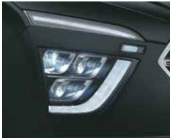
Trio beam LED headlamps with crescent glow LED DRLs