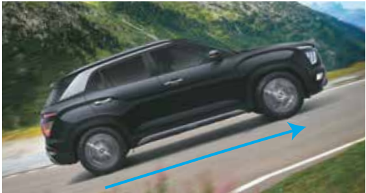
Hill start assist control (HAC)