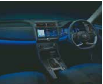
Soothing blue ambient lighting