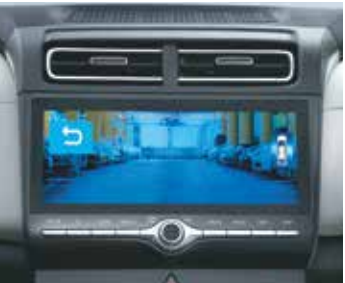
Driver rear view monitor

Savor the awe inspiring beauty all around when you get in the all-new Creta. The plush new interiors give you the advantage of extra comfort on every ride. Breathe in the wonders of nature and relish exquisite scenic views as you make your way across all-terrains of life.