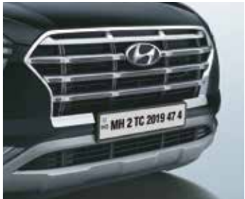
Signature cascading grille

With a breathtakingly beautiful and edgy design, the all-new Creta has been crafted to command respect. The bold exterior and the new masculine stance will set you apart from every other SUV on the road. No matter where you decide to go, the all-new Creta will help you stay one step ahead on the road.