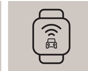
Connected car features in smart watch app*