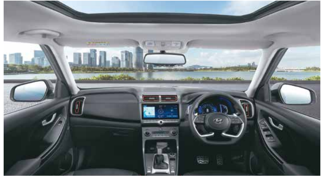
All black interiors with orange colour pack