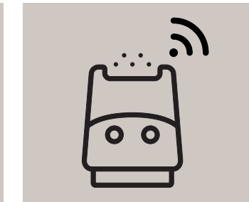
Remote air purifier on*