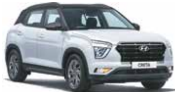
Polar white with phantom black roof*