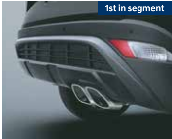
Twin tip exhaust (turbo only)