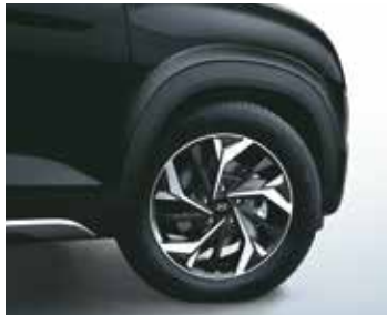
R17 (D=436.6 mm) Diamond cut alloys