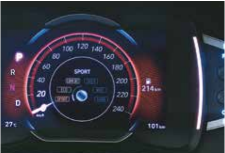
Drive mode select (eco, comfort & sport)