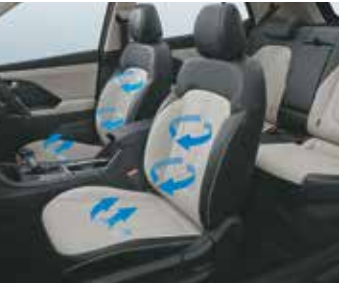
Front row ventilated seats