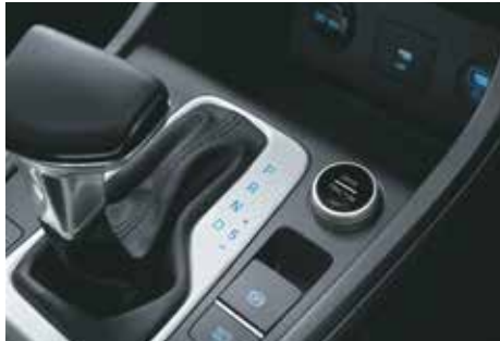
7-speed DCT, 6-speed automatic transmission & IVT