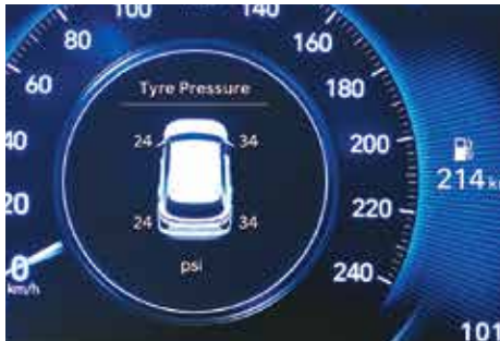
Tyre pressure monitoring system (TPMS)