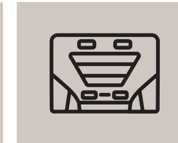
Voice operated open/close sunroof*

Bluelink with 50+ features and 3 Years free Bluelink subscription OTA map updates