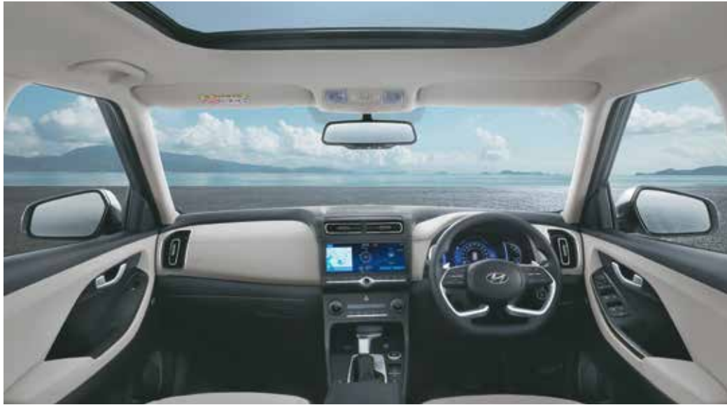
Two tone black & greige interiors